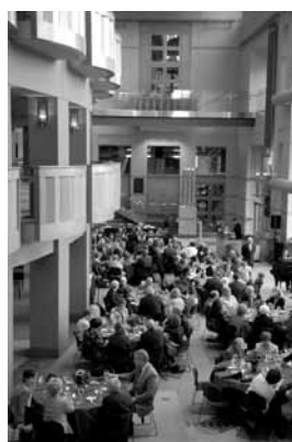
Gala attendees enjoy dinner in the lobby of NJPAC