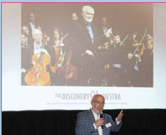
Encore Screening “Spring & Summer” from Discover Vivaldi’s Four Seasons