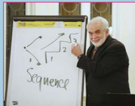
A Musical Exploration “Winter” from Discover Vivaldi’s Four Seasons