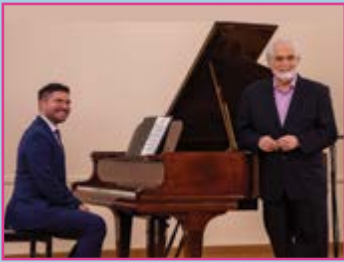
Premiere Screening Discover Mozart – Variations on a Familiar Tune