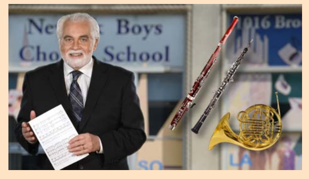
Episode 12: A Visit to the Chorus School