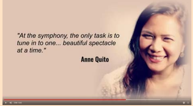
Episode 14: Our Sagging, Flabby Attention Spans

View all the episodes here: https://discoveryorchestra.org/notes-from-under-the-piano/