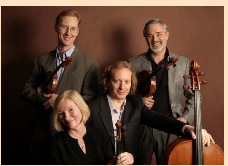
featuring The American String Quartet