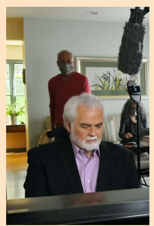
Video Chat Taping